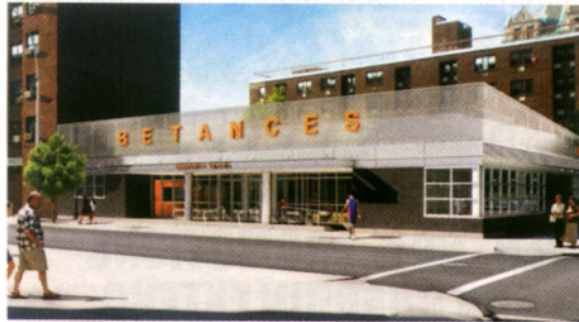
The future home of the Betances Boxing Program