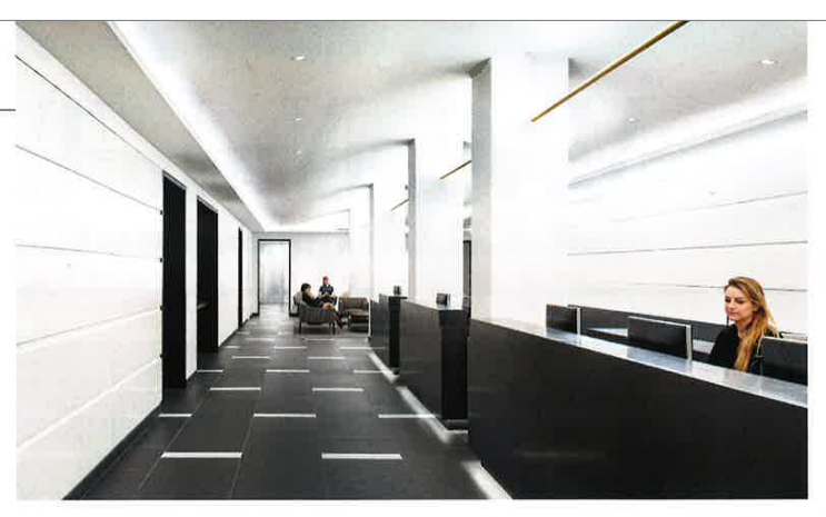
ABOVE: The registration area for the clinic has a shallow-barrel vaulted ceiling that recalls some of the curved forms on the exterior, RIGHT: The building lobby includes a small reception desk; elevator; and a stairwell with stone treads, perforated risers, and glass guards that leads up to the clinic.

The final layout organizes reception in a long space on one side of the clinic with primary care and dermatology clinics along the other side to take advantage of the natural light provided by the building's light courts. Instead of individual physician offices, Mount Sinai utilizes caregiv-